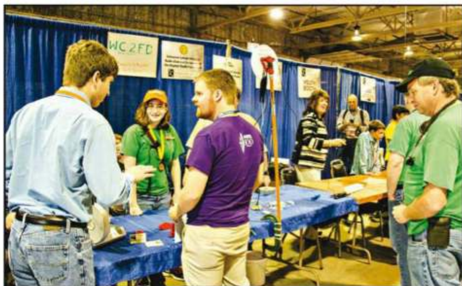
Photo E. There were many volunteers who helped out at the Dayton Youth Booth.