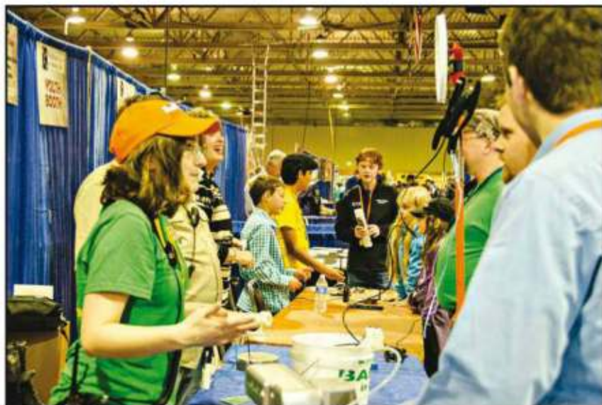
Photo A. Young people flocked to the Dayton Hamvention@ Youth Booth to meet the young Youth Forum presenters and to get an up-close look at the objects of their talks.