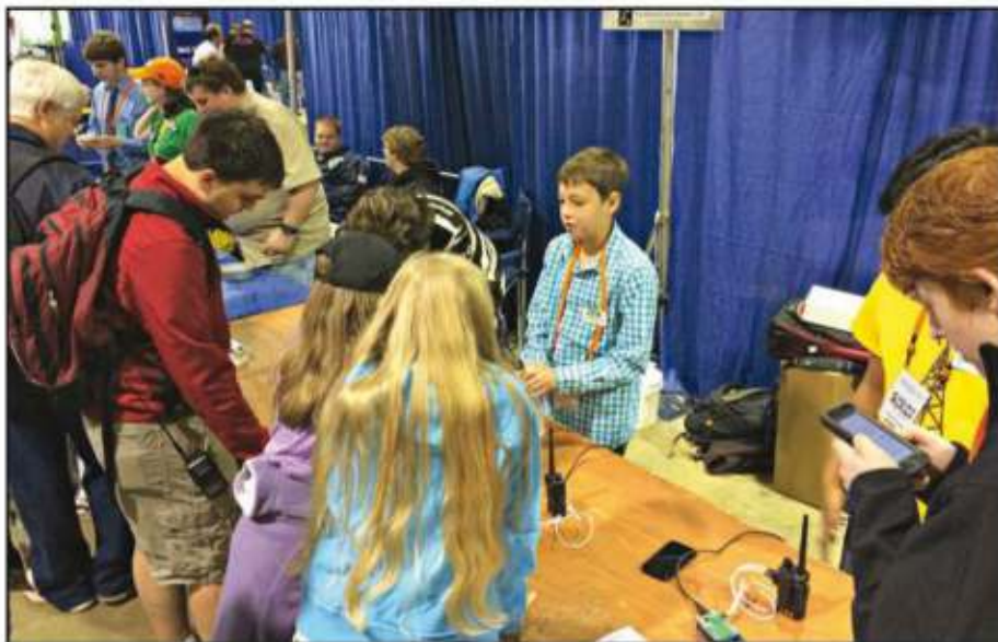
Photo D. The Youth Booth had a steady stream of visitors — both young and old — throughout the Hamvention@ weekend in May.

Hope to see more and more supportive hams coming to the forum every year! It's a wonderful movement to be part of.