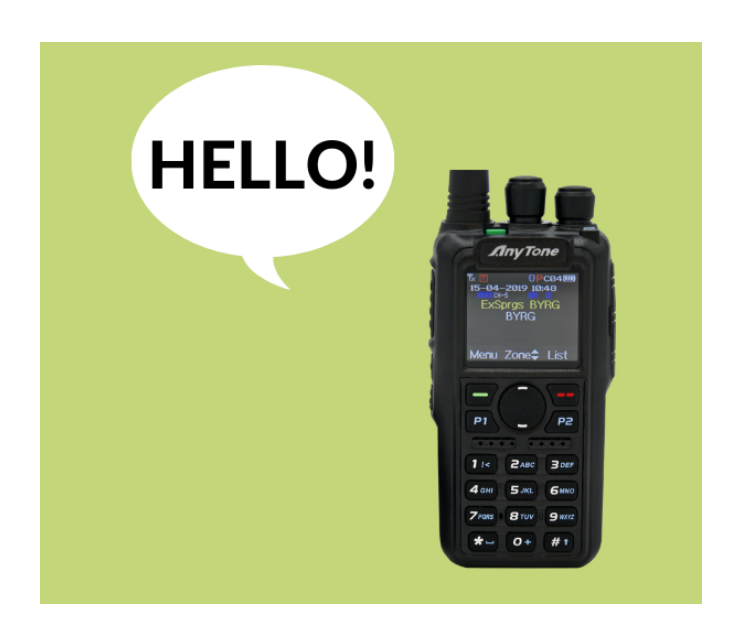
STEP 3: Make a Contact